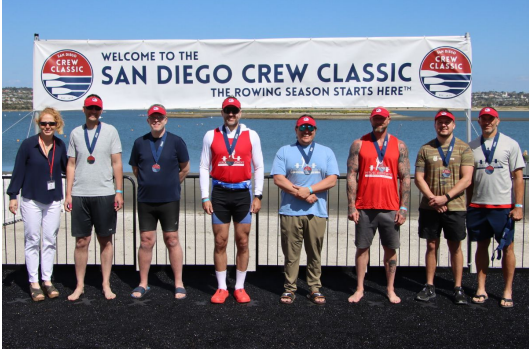
If you're interested in learning more about program opportunities, feel free to <u>email Debbie</u> <u>Arenberg</u> to learn more