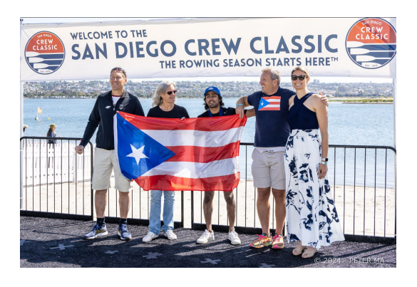
Congrats to Club Nautico de San Juan and their boat of Brown Alumni who competed and won against the United Kingdom's Armed Forces.